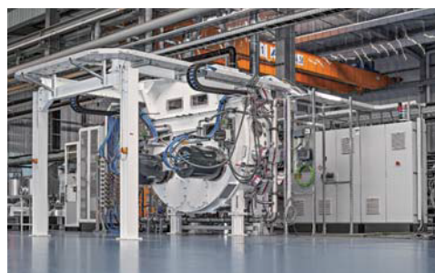
FOSA LabX 330 GLASS