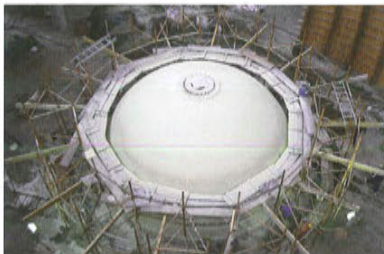
A 3.7-tonne internal dome

The smooth internal surface of the GRC was ideal for decorative painting.