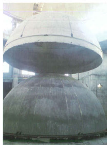
Completed dome and mould