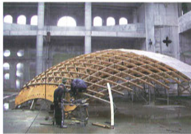
Formwork under construction

150m 2 . The timber used had been covered with a special coating to give the required high quality finish.