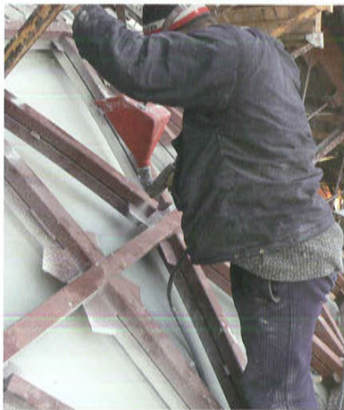
Spraying first coat

With the quantity of GRC to be sprayed, each section took a full day to spray and the formwork was left in place a further day before the formwork was moved to the next section and the process repeated.