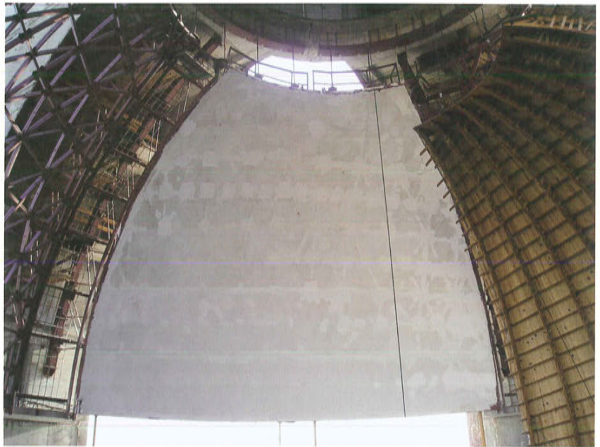
Internal view of first section

The remaining sections of the dome were then finished, which allowed the insulation and waterproofing to be completed.