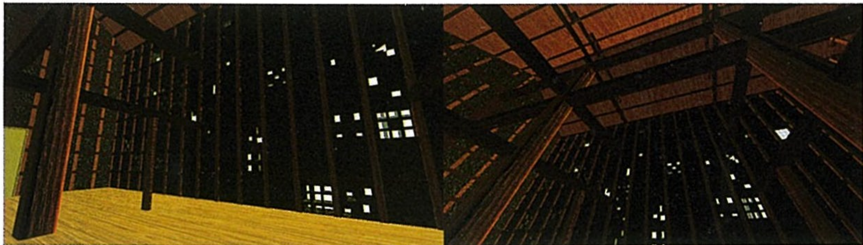
Fig. 1 Fig. 2 Fig. 3 Fig. 4

Technical specifications or notes in small font, possibly detailing material properties or installation requirements for the glass blocks.